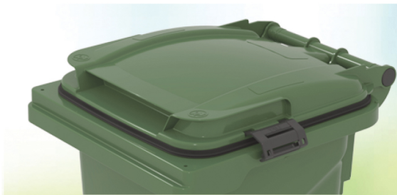
Fastening clamps with seal