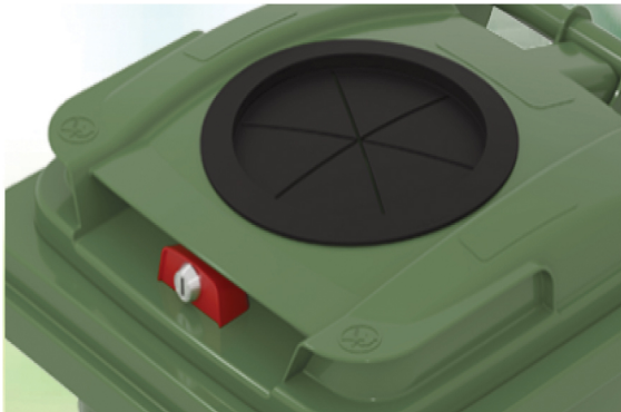
Recycling inserts for waste sorting and gravity lock