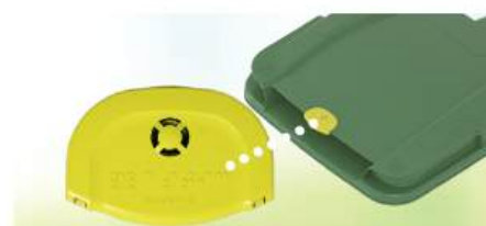
Colour Clip marking with Braille inscription