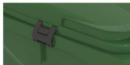
2 detachable fastening clamps