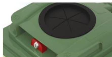
Recycling inserts for waste sorting and gravity lock